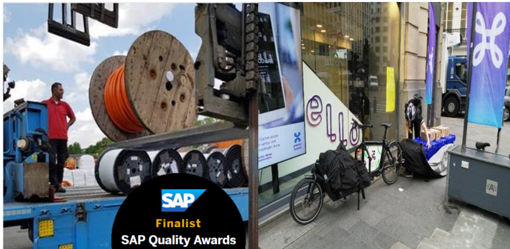
IOT reel tracking