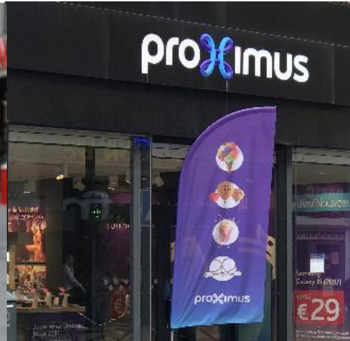
Predictive CPE maintenance