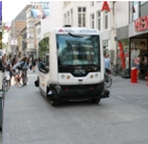
Self driving vehicles